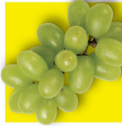
1 handful of grapes