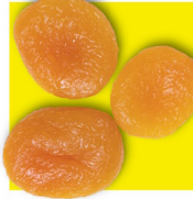
3 whole dried apricots