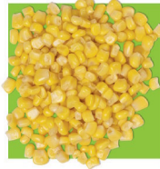
3 heaped tablespoons of sweetcorn