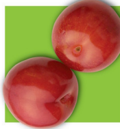
2 medium plums