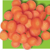
3 heaped tablespoons of carrots