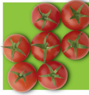
7 cherry tomatoes