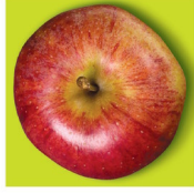
1 medium apple