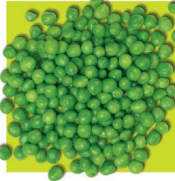
3 heaped tablespoons of peas