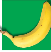
1 medium banana