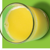
1 medium glass of orange juice