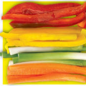
1 handful of vegetable sticks