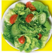
1 cereal bowl of mixed salad