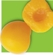
2 halves of canned peaches