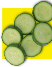
half a large courgette