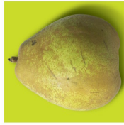
1 medium pear