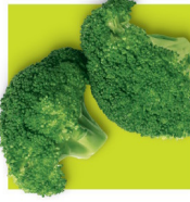
2 broccoli florets