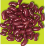
3 heaped tablespoons of cooked kidney beans