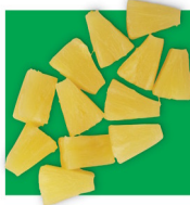
12 chunks of canned pineapple